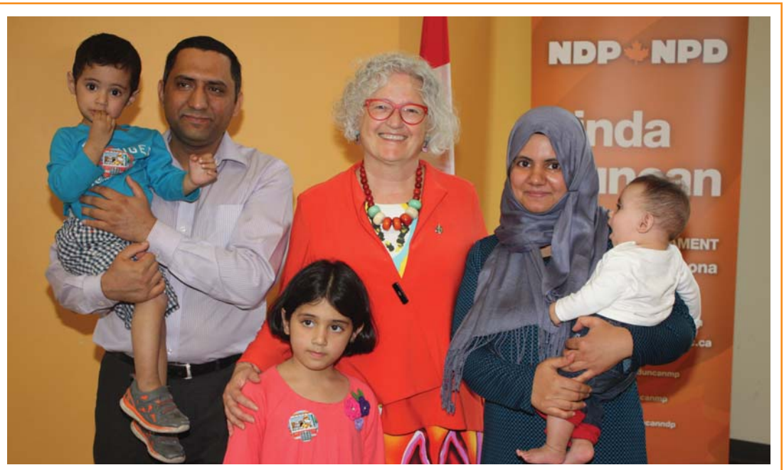
In May I held a reception for new Canadian citizens living in Edmonton-Strathcona and was thrilled to meet so many people from around the globe who have made Canada and Strathcona their new home.

Like many of you, I was touched and deeply impressed by the work of the Truth and Reconciliation Commission as they gathered in