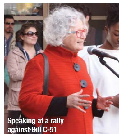
Speaking at a rally against Bill C-51

I spoke in the emergency debate on the conflict situation in Ukraine commending the Ukrainian-Canadian community for their advocacy and support and for increased Canadian aid in support of both a peaceful resolution and civil society efforts to strengthen rule of law and democratic governance.