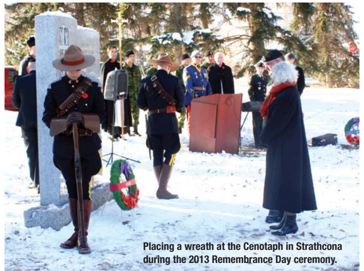
Placing a wreath at the Cenotaph in Strathcona during the 2013 Remembrance Day ceremony.