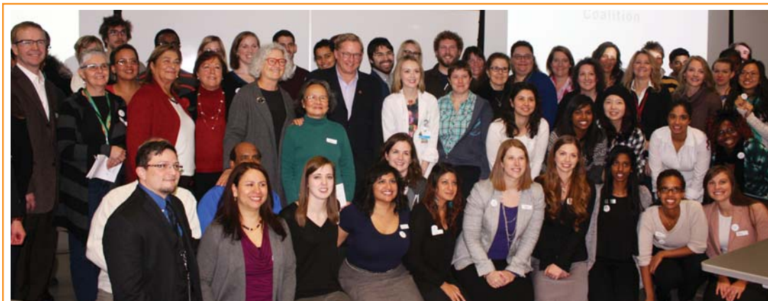
With members of the Alberta Refugee Health Care Coalition at their recent launch of their report "Filling the Gaps". The group, which includes many Edmonton physicians, medical students, residents and other health care professionals, has expressed deep concern about the implication of federal cuts to essential health care services for refugees and refugee claimants and is campaigning for their reinstatement. Find out more about their organization at www.ARCHealth.com .

The Canada Health Accord expires in 2014. Yet despite the fact Albertans and most Canadians continue to identify public health care as a top priority, the Conservative government still refuses to meet with provincial and territorial partners. There has been no commitment for a second accord with binding targets. No federal action has been taken on a National Pharmaceutical Strategy — a stated goal of the 2004 Health Accord, despite efforts by some provinces to collaborate to provide more affordable access to prescription drugs. One in 10 prescriptions remains unfilled because some patients lack the resources to