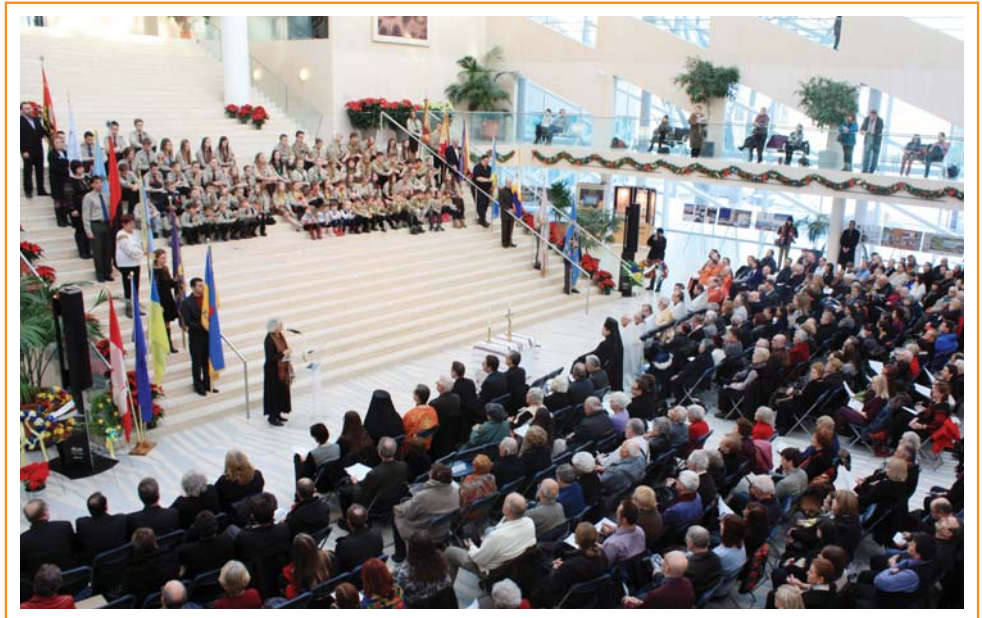
On November 23 I was honoured to represent my parliamentary colleagues at the commemoration of Holodomor—the tragic famine in Ukraine 1932/1933—which was held at Edmonton City Hall and at the memorial outside.

As Official Opposition Critic for Western Economic Diversification (WED), I continue to pursue incentives and sup-